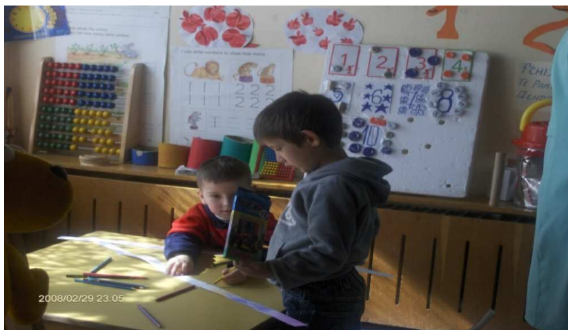
Figure 4. Choosing activity according to the interest of a child