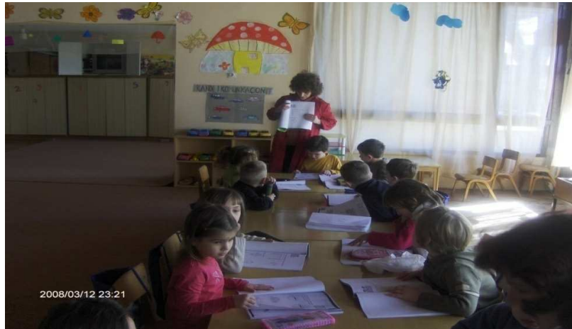
Figure 1. Work in the classroom of control group (impossibility to choose activity)