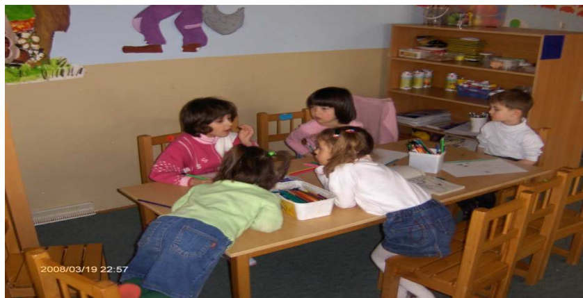
Figure 3. Choosing a friend to play